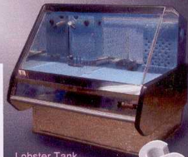
Lobster Tank To Match Display Case