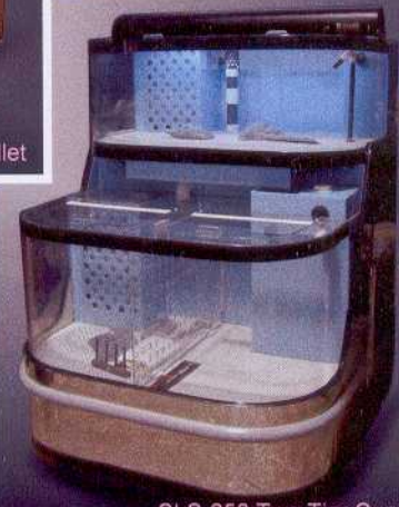
SLS-250 Two Tier Curve